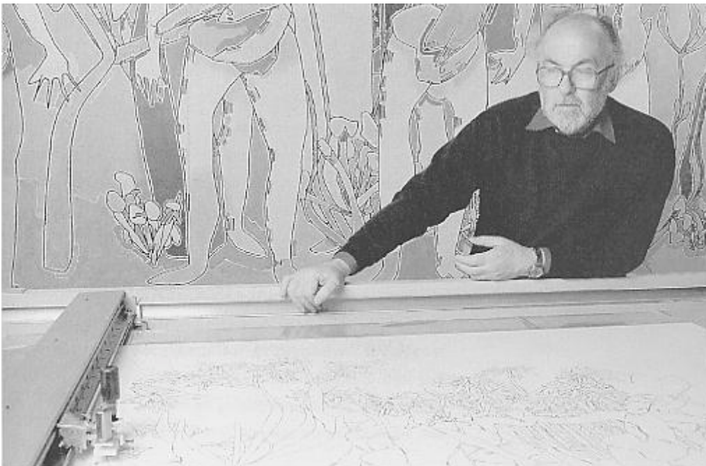
Harold Cohen, computer artist.