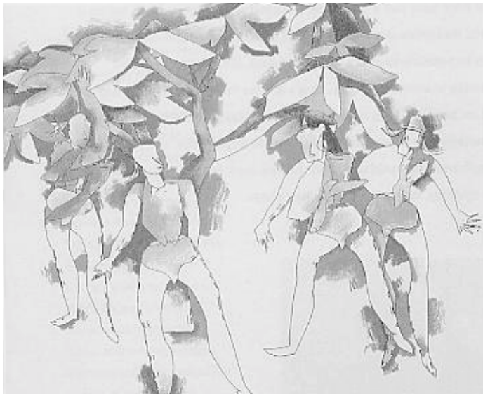
From the Bathers series of hand-colored, computer-generated drawings by Harold Cohen.